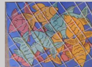
Breakfast with Jesus John 21:1-19